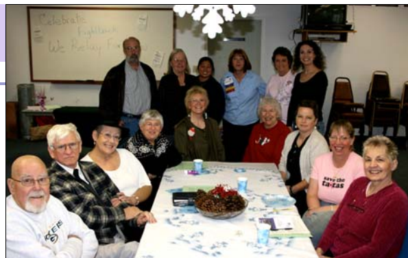
North Whidbey Survivor Christmas Tea

"You have to be a good listener. To let them talk. It's really about them." To connect with the program of your choice please call 1.800.ACS.2345 or www.cancer.org .