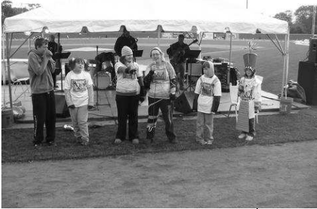
T-shirt Competition '08

THIS YEAR ONLY, our Relay For Life event has the historic opportunity to directly FIGHT BACK against cancer through research. The American Cancer Society is looking for participants to enroll in and promote the American Cancer Society's Cancer Prevention Study-3 (CPS-3) at our Relay.