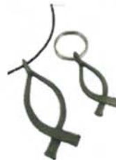
Ichthus Key ring or necklace $9.00