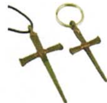
Cross necklace or key ring $9.00