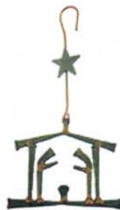
Nativity Ornament $15.00