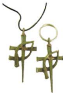
Ichthus cross or key ring 14.00