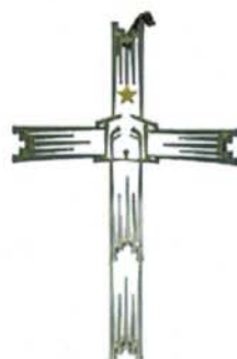
Nativity Cross Wall Hanging $45.00