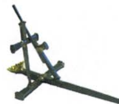
No Greater Love (Honors our veterans – note the rifle) $20.00

From the beginning, we felt the desire to use square nails to make something with a Christian message behind it. The cross is to remind us of our Savior's dying for our sins and the nail remind us of the terrible price He paid. Our creations remind us that it was God's love for us and that, although he suffered on the cross, he remained there not because of the nails, but because of his love for us.