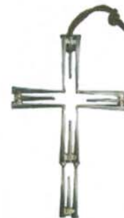
Small cross wall hanging $18.00