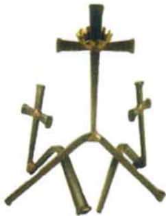
Calvary - Free Standing Piece $20.00