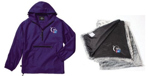
PACK-N-GO PULLOVER OR VELVAFUR THROW