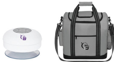
WATER RESISTANT BLUETOOTH SPEAKER OR FLIP FLAP INSULATED COOLER BAG