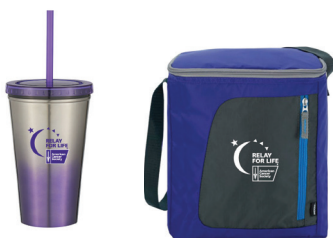
16 OZ. STAINLESS STEEL TUMBLER OR KOOZIE 12-PACK KOOLER