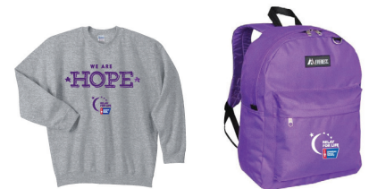
CREWNECK SWEATSHIRT OR EVEREST BACKPACK

Please visit RelayForLife.org/fundraisingrewards for additional fundraising ideas!