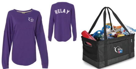
FRENCH TERRY DOLMAN SLEEVE SWEATSHIRT OR DELUXE UTILITY TOTE