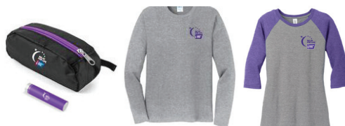
MOBILE CHARGER KIT - POWER BANK, POUCH AND USB CABLE INCLUDED OR PREMIUM LONG SLEEVE T OR 3/4 SLEEVE RAGLAN T-SHIRT