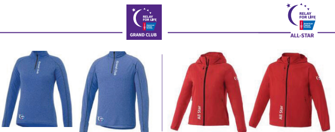
GRAND CLUB $1,000 Taza quarter-zip 100% micro-polyester moisture wicking, antimicrobial finish

could help provide 10 rides to and from treatment for a cancer patient.