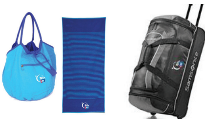
BAG AND TOWEL SET OR SAMSONITE ROLLING DUFFEL