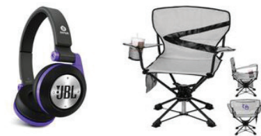
JBL SYNCHROS E40BT BLUETOOTH HEADPHONES OR SWIVEL CHAIR