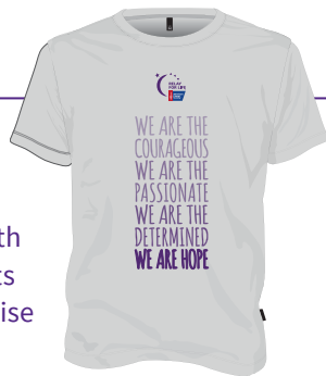
HOPE CLUB $100

Every dollar raised makes an impact. With the Relay For Life Hope Club, participants who make a serious commitment and raise $100 or more will receive the 2017 event T-shirt to wear as badge of honor.